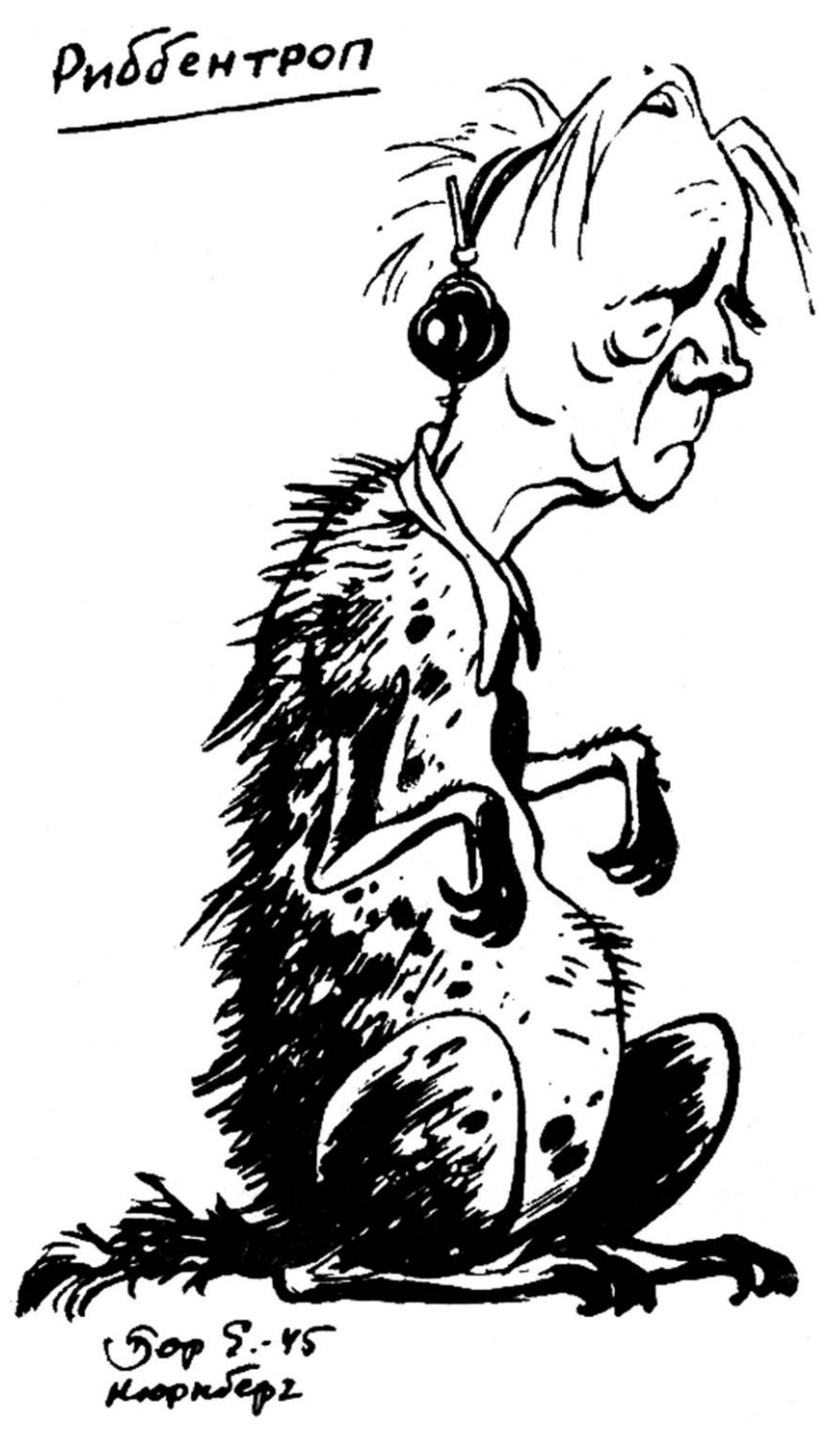
FIGURE 6: Joachim von Ribbentrop as drawn by Boris Efimov, from the series "Fascist Menagerie." This caricature was published in the Soviet newspaper Krasnaia zvezda on December 15, 1945.