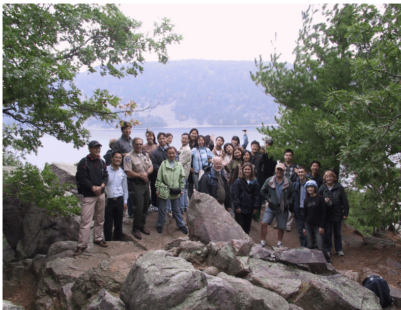
Municipal Workers from Xuhui District et al. at Devil's Lake State Park, Wisconsin